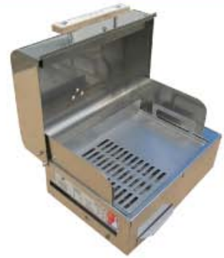
Bravo BBQ shown with flat/grill plate

AFPBBQ Alpha with flat plate AGPBBQ Alpha with flat/grill plate