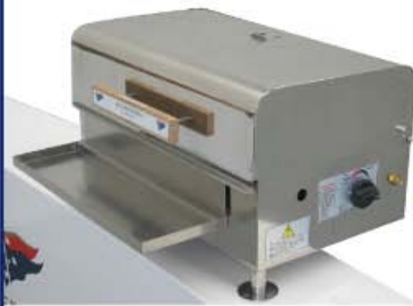
Alpha BBQ shown fitted with optional utensil tray