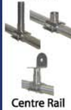
Centre Rail Mount