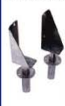
Rear Recess Deck Mount