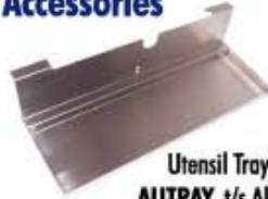
Utensil Tray AUTRAY 1/s Alpha BUTRAY 1/s Bravo