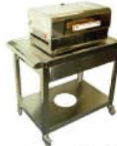
Folding Stainless Steel Stand STANAB 1/s Alpha STANBB 1/s Bravo