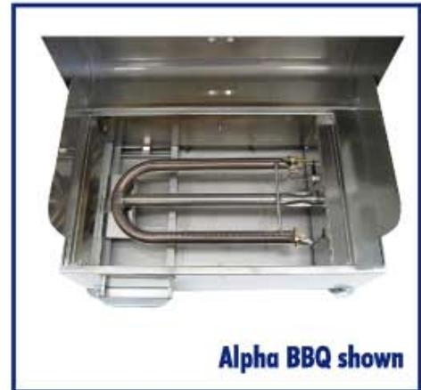
Alpha BBQ shown