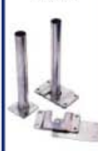
Front Slot Mount

*Telescopic Support Rod available for rail mount installations.