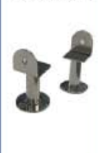
Centre Recess Deck Mount