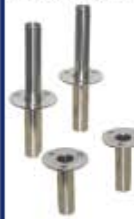
Front Recess Deck Mount